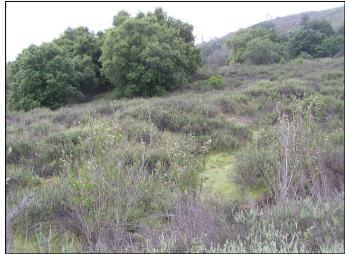
Photograph 6: View from Margarita candidate location, facing southwest.