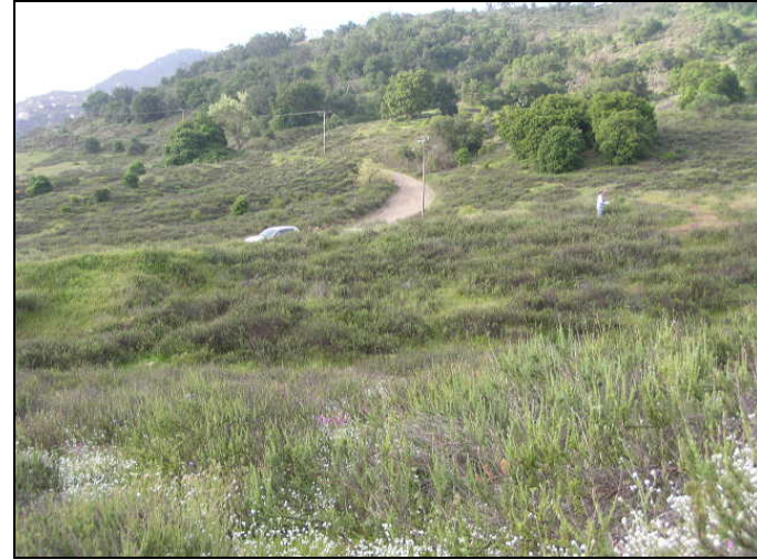
Photograph 2: View toward Margarita candidate location, facing south.