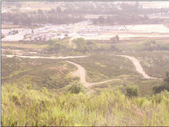
Photograph 3: Overview of Margarita candidate location, facing east.