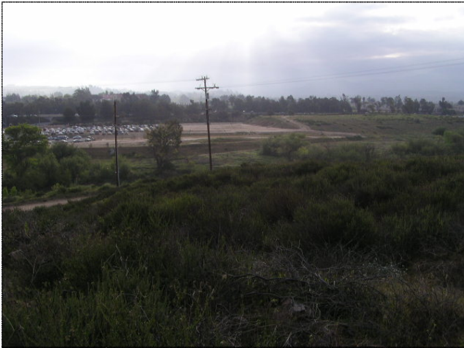
Photograph 7: View from Margarita candidate location, facing east.