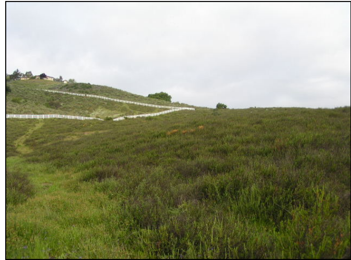
Photograph 8: View from Margarita candidate location, facing northwest.