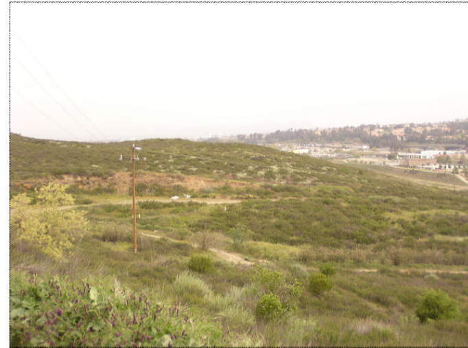
Photograph 4: Overview of Margarita candidate location, facing north.

Source: Michael Brandman Associates, 2008.