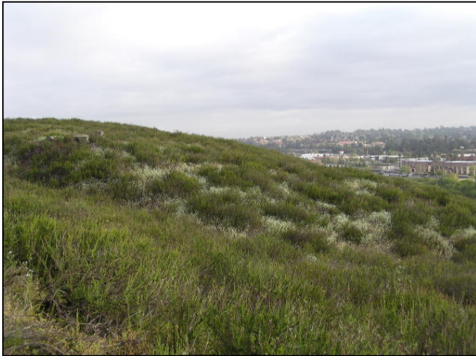
Photograph 5: View from Margarita candidate location, facing north.