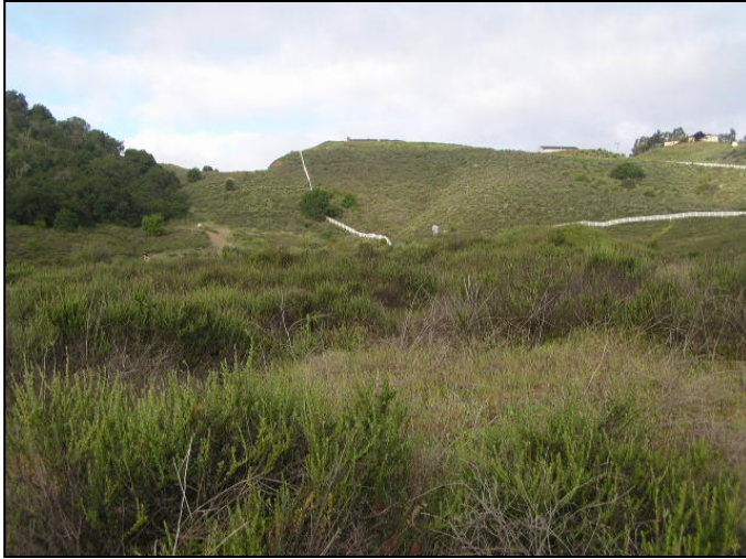
Photograph 1: Overview of Margarita candidate location, facing west.